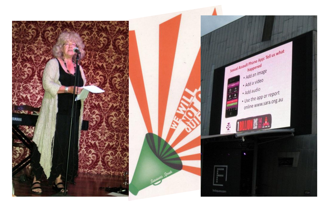
"We Will Not Go Quietly" launch